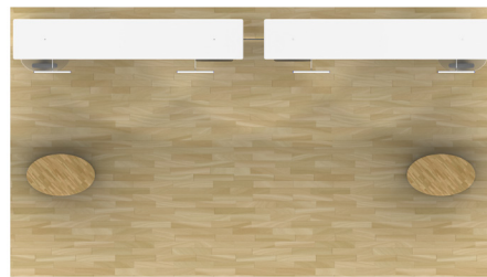
Aerial grid of 20' x 10' space