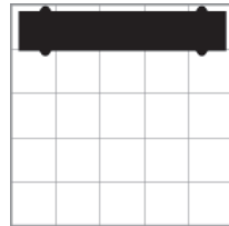
Aerial grid of 10' x 10' space

Our Timberline™ Hybrid Series gives you the ultimate in versatility. Customizable modular displays can be arranged in numerous configurations. Displays are easy to set up and adjust to fit any size area. Showcase your products for your tradeshows or special events with a variety of options such as reception desks and shelves.